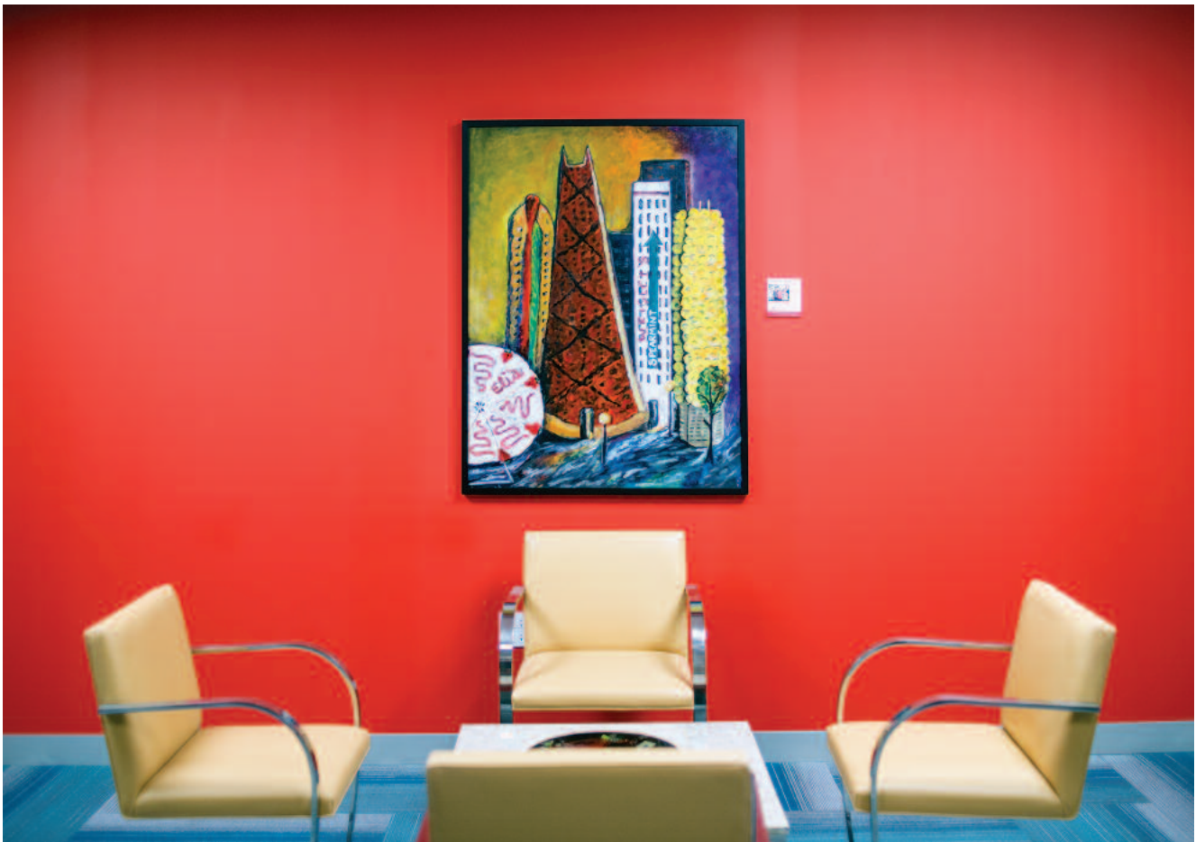
Before signing a new lease at 3 First National Plaza, the partners at Sheppard Mullin Richter & Hampton insisted that physical upgrades be made to the space.