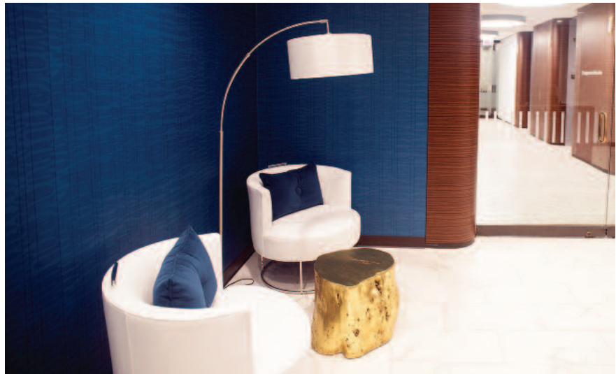
Sheppard Mullin's renovations happened during work hours, so employees had to navigate around construction.

"We could've lived with the kitchen at the size it was, but we didn't need the room for files anymore, and it would've just become